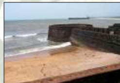
Aguada Fort 5 km / 15 mins