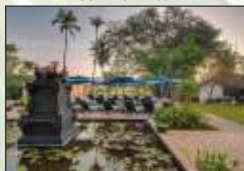
Novotel Resort & Spa 1 km / 4 mins