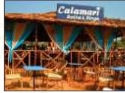
Calamari Shack 1.5 kms / 18 min