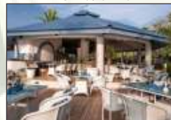
Olive Bar Vagator 12 km / 30 mins