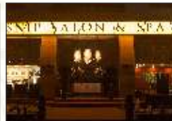
Snip Salon & Spa 2.2 km / 6 mins