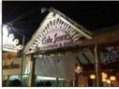
Café Jazz 300 m / 3 min