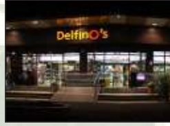
Delfino's Hymart 250 m / 3 min