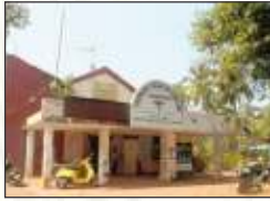
Health Centre 250 m / 3 min