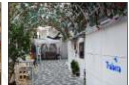
Thalassa Vagator 12 km / 30 min