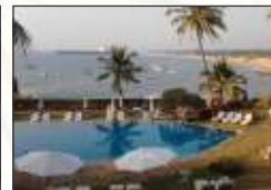
Taj Holiday Village 2.2 kms / 7 mins