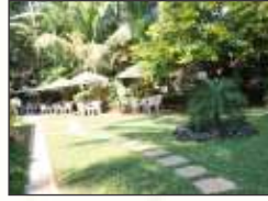
Café Chocolatti 800 m / 10 min