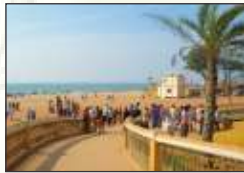
Calangute Beach 5 km / 15 mins