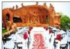
LPK Waterfront 2.3 kms / 6 mins