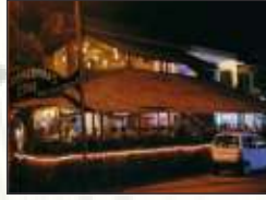
Fisherman's Cove 300 m / 4 min