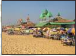
Candolim Beach 250 m / 3 min