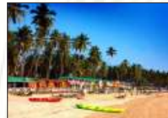
Ashwem Beach 22 km / 45 mins