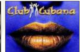
Club Cabana 7.2 km / 20 min