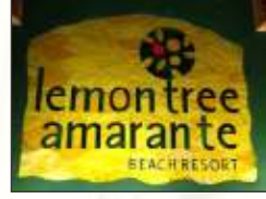
Lemon Tree Hotel 270 m / 3 min