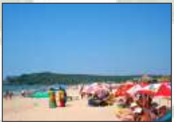
Baga Beach 6 km / 15 mins