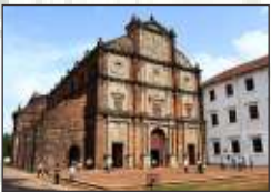
Old Goa Church 20 km / 40 mins