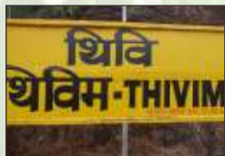
Thivim Station 20 km / 40 mins