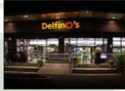
Delfino's Hymart 250 m / 3 min