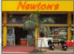
Newton's Hymart 450 m / 5 min