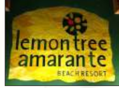
Lemon Tree Hotel 270 m / 3 min