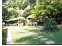
Café Chocolatti 800 m / 10 min