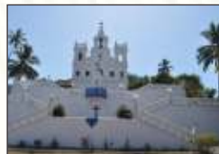
Panaji City 11 km / 25 mins