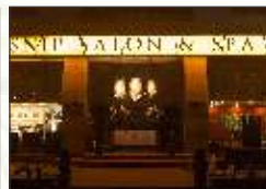
Snip Salon & Spa 2.2 km / 6 mins