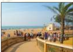
Calangute Beach 5 km / 15 mins