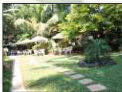
Café Chocolatti 800 m / 10 min