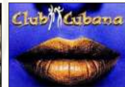
Club Cabana 7.2 km / 20 min