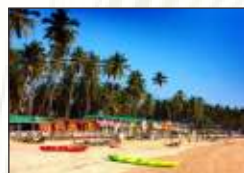
Ashwem Beach 22 km / 45 mins