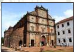
Old Goa Church 20 km / 40 mins