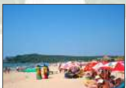
Baga Beach 6 km / 15 mins