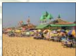
Candolim Beach 250 m / 3 min