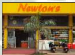
Newton's Hymart 450 m / 5 min