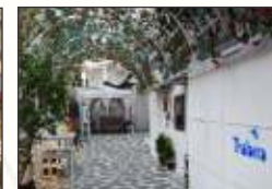
Thalassa Vagator 12 km / 30 min