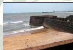
Aguada Fort 5 km / 15 mins