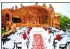
LPK Waterfront 2.3 kms / 6 mins