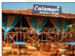
Calamari Shack 1.5 kms / 18 min