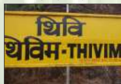
Thivim Station 20 km / 40 mins