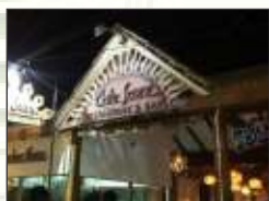
Café Jazz 300 m / 3 min