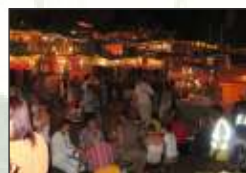
Anjuna Night Market 11 km / 20 min