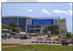
Goa Airport 38 km / 1 hour