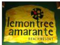
Lemon Tree Hotel 270 m / 3 min