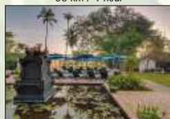
Novotel Resort & Spa 1 km / 4 mins