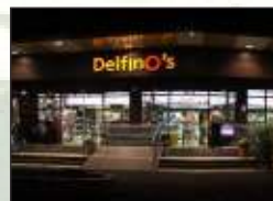
Delfino's Hymart 250 m / 3 min