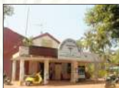
Health Centre 250 m / 3 min