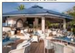
Olive Bar Vagator 12 km / 30 mins