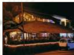
Fisherman's Cove 300 m / 4 min