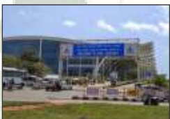
Goa Airport 38 km / 1 hour