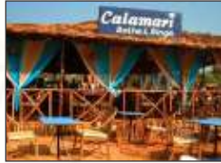
Calamari Shack 1.5 kms / 18 min