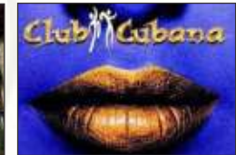
Club Cabana 7.2 km / 20 min