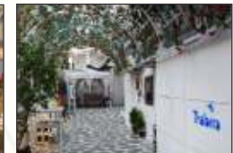
Thalassa Vagator 12 km / 30 min