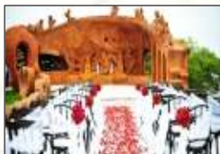
LPK Waterfront 2.3 kms / 6 mins