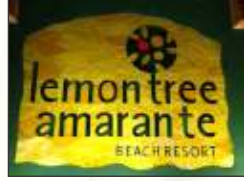
Lemon Tree Hotel 270 m / 3 min