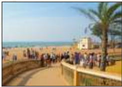
Calangute Beach 5 km / 15 mins