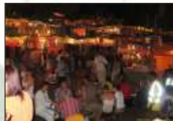
Anjuna Night Market 11 km / 20 min